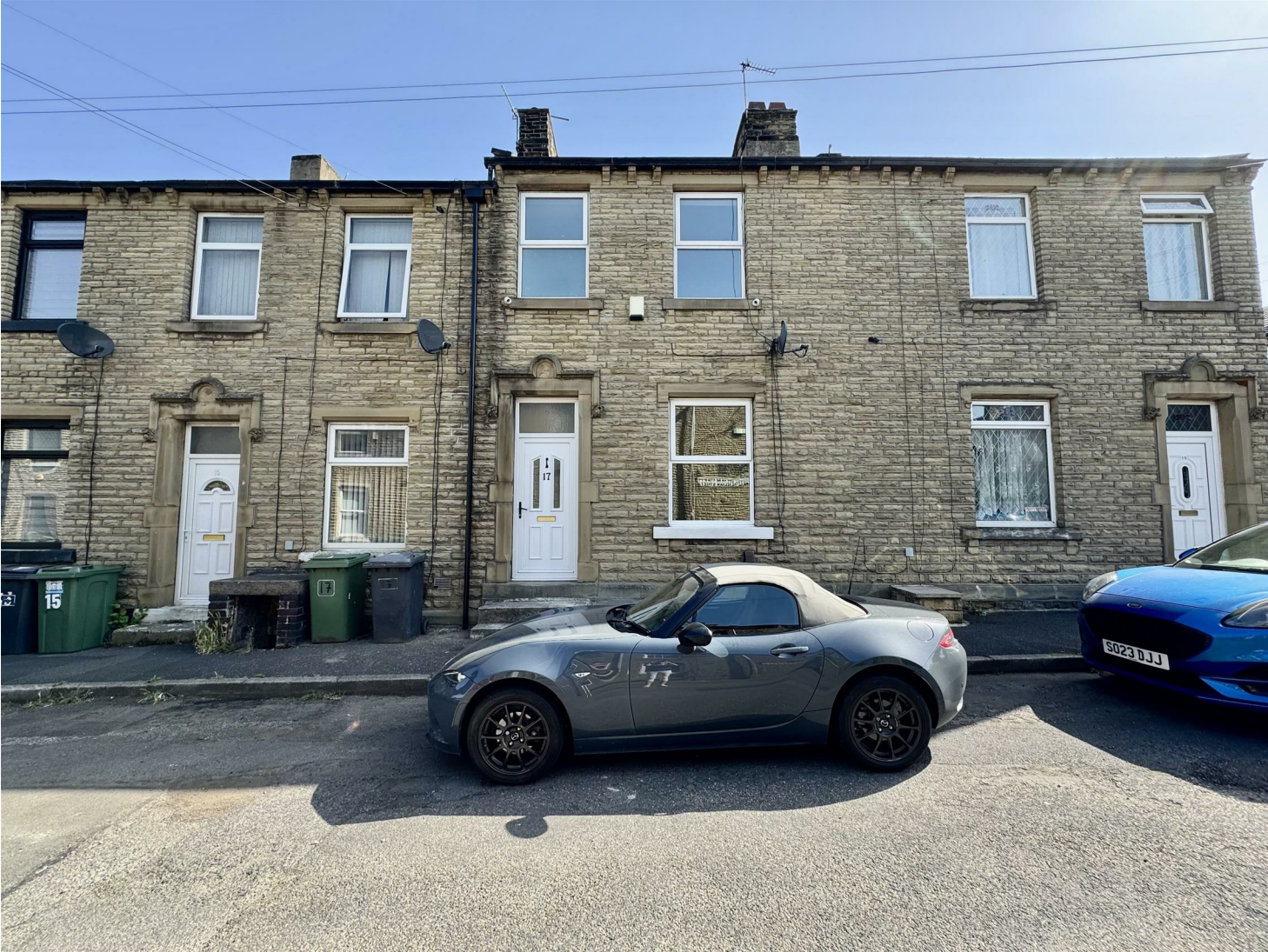
On-street parking is readily available to the front.